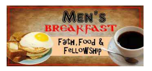
MEN'S BREAKFAST Saturday, January 7 @ 8:00 A.M. All men welcome!

After the first of the year, birthing kits will be available in the church office to take home and sew for the Congo.