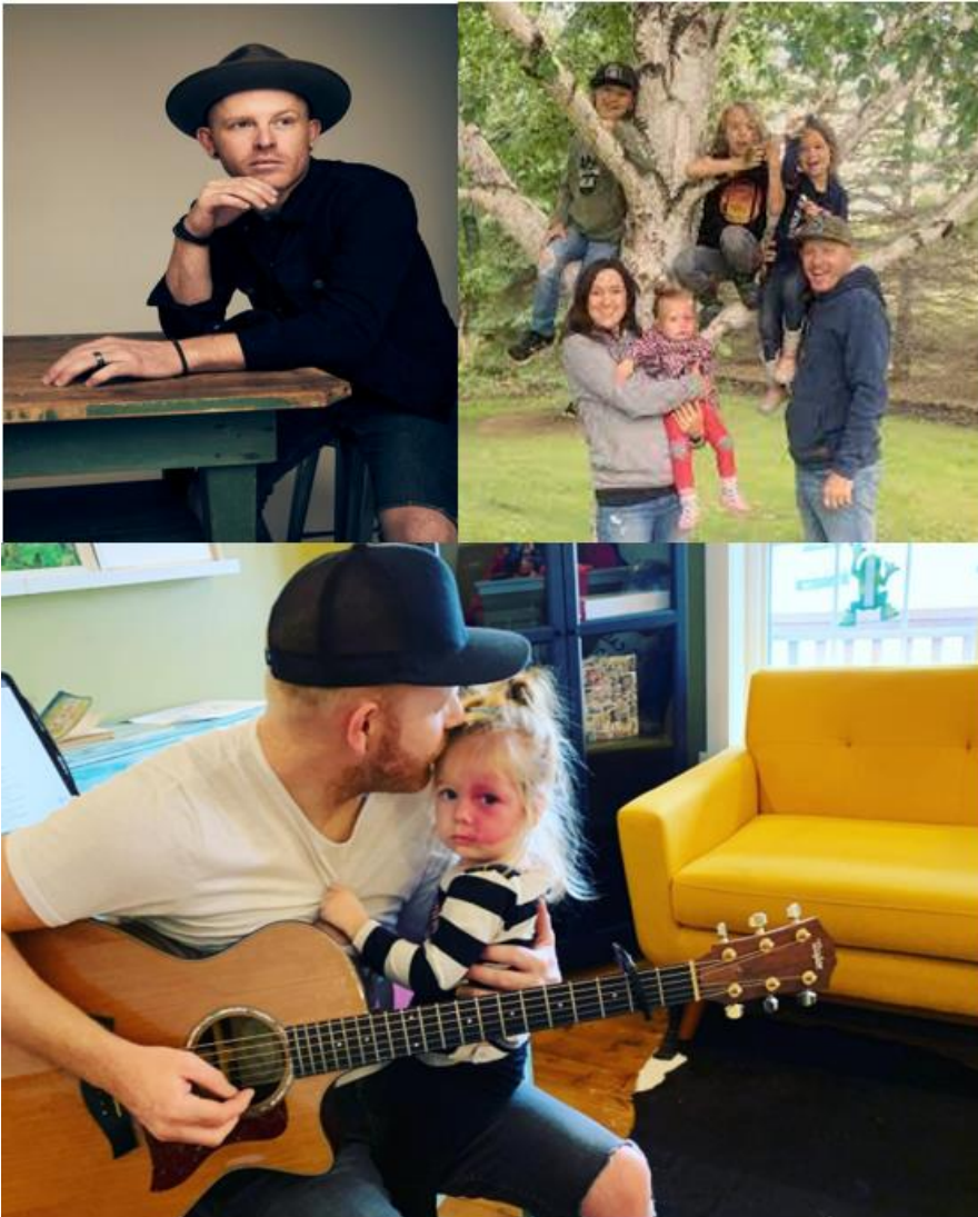
Husband. Father of two boys and two girls. Singer. Songwriter. Storyteller. Sharer of God's Word.

June 10 th , 7PM – First Baptist Church, Fairfield IA